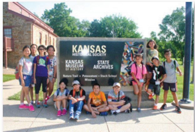
American Study Tour