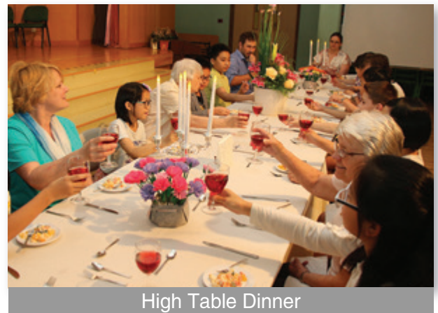
High Table Dinner