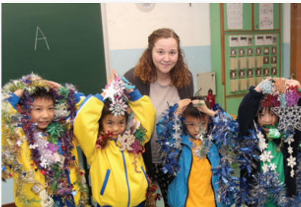
English Gospel Day Camp