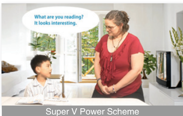
Super V Power Scheme