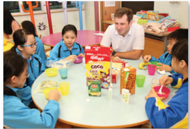
English Healthy Breakfast

學生透過多元化的英語學習活動，包括：英語早餐、英語午餐、高桌晚宴、英語話劇、英語午間廣播、微電影製作、超級V能量計劃、V能量計劃、英語早會、英語日等，培養學生學習英語的興趣。