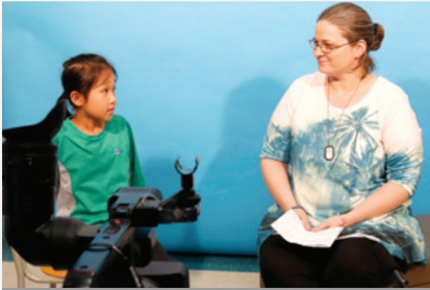
English Micro-film Making