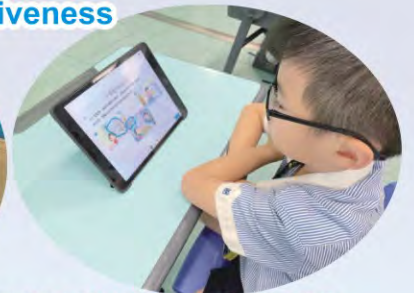
透過電子學習的輔助，提升課堂上師生的互動性，為學習增添樂趣。 By incorporating e-learning tools, the interaction between teachers and students in the classroom is enhanced, adding an element of fun to the learning process.