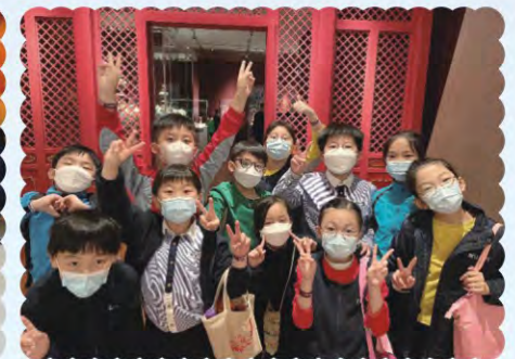
參觀香港故宮文化博物館，加深對中國文化、藝術及歷史的認識。 Visiting the Hong Kong Palace Museum deepens one's understanding of Chinese culture, art, and history.