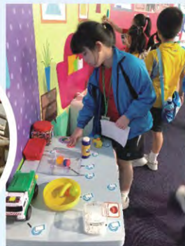
參觀環保園，提升對香港都市固體廢物處理的認識及環保意識。 Visiting an EcoPark enhances awareness and understanding of urban solid waste management in Hong Kong, promoting environmental consciousness.