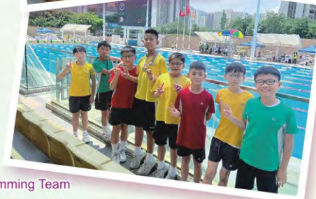
男子泳隊 Boy's Swimming Team