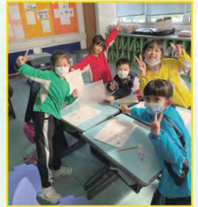
學生在課堂上測試不同物料的吸水和透光特性，以製作紙杯投影燈，學習光和影的科學原理。Students test the water-absorption and light-transmission properties of various materials in the classroom to create paper cup projectors. Through this activity, they learn about the scientific principles of light and shadows.