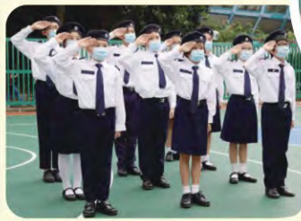
紅十字少年團 Red Cross Youth Corps