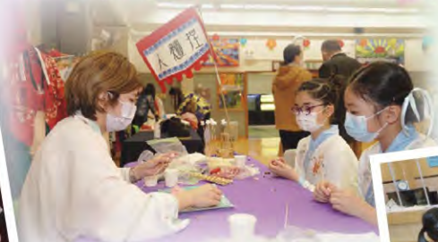
同學們對中國傳統手工藝「糖畫」製作很感興趣 Students showed great interest in the traditional Chinese art of sugar painting and actively participated in its creation.

Through the production of masks, students can learn about traditional Chinese opera and promote Chinese culture.