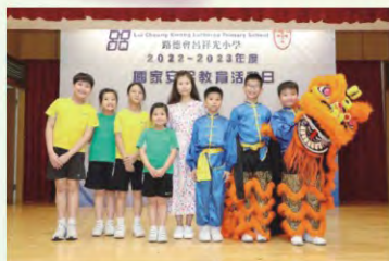
獅藝隊 Lion Dance Team