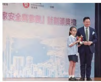
2023 國家安全寫作比賽 優異獎 2023 National Security Writing Competition Merit Award