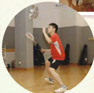
羽毛球隊 Badminton Team