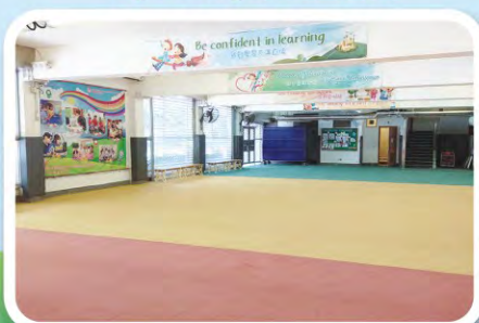
Covered Playground 內操場