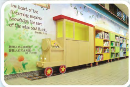
Solomon Storyland 所羅門英語世界