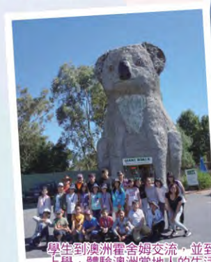
學生到澳洲霍舍姆交流，並到當地聖三一小學上課，與澳洲學生一起生活及上學，體驗澳洲當地人的生活。 Students participate in an exchange program to Horsham, Australia, where they attend classes at the local Holy Trinity Lutheran College School and live alongside Australian students. This immersive experience allows them to gain firsthand knowledge of the lives and culture of the local Australian community.