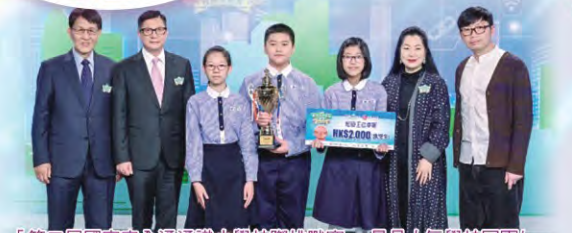
「第二屆國家安全通識小學校際挑戰賽」- 最具人氣學校冠軍/ 最傑出學校表現亞軍/知識王者季軍/全港最強知識王(封神榜)(冠軍) "The 2nd National Security General Education Primary School Inter-School Challenge" Most Popular School Champion/Outstanding School Performance Second Place/Knowledge Champion Third Place/ Hong Kong's Strongest Knowledge King (Hall of Fame) (Champion)