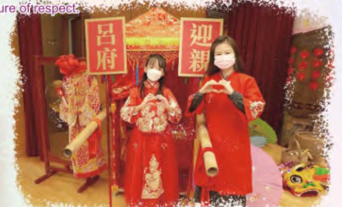
學生穿上不同款式的華服參與活動，有穿著龍袍、裙褂、仕女服等 Students wore different styles of costumes to participate in the Chinese Culture Extravaganza Day, such as dragon robes, skirt dresses and ladies' clothes.