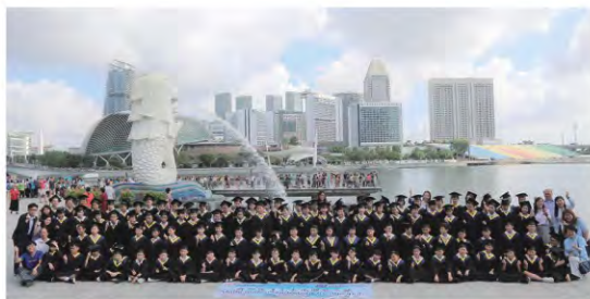
學生遠赴新加坡交流，透過參觀新加坡植物園及博物館，認識熱帶地區的生態。 Students embark on an exchange program to Singapore, where they visit the Singapore Botanic Gardens and museums to gain an understanding of the tropical ecosystem in the region.