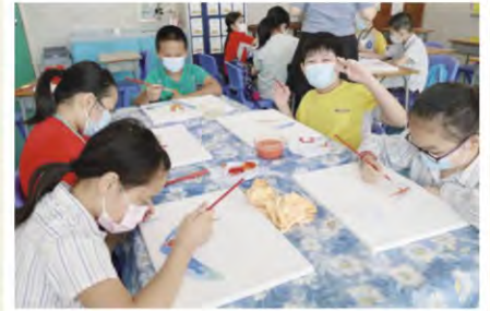
空間智能：發展孩子的觀察能力及三維空間感，與藝術質素培養更是息息相關。 Spatial Intelligence: Developing children's observational skills and 3D spatial awareness is closely related to cultivating artistic qualities.

Our school adheres to the philosophy of Christian whole-person education, and firmly believes that every student is unique and endowed with different talents. "The gifts we receive are different." (Romans 12:6) This is just like the theory of Multiple Intelligences that everyone has a unique combination of intelligence. Therefore, our school organizes extracurricular activities based on this theory to inspire students' potential. In addition, various uniformed teams and school teams are available for students to enhance physical wellness, cultivate a sense of responsibility and law-abiding awareness, and develop leadership skills. The school also offers a variety of interest classes that are beneficial to the body and mind, so that students can form their character in a desirable direction.