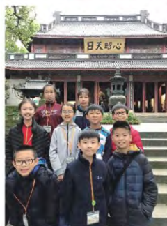
學生到杭州交流，到訪當地小學，並參觀杭州博物館及岳王廟，了解當地的歷史及手工藝發展。 Students engage in an exchange program to Hangzhou, where they visit local primary schools and explore the Hangzhou Museum and Yuewang Temple. This allows them to gain knowledge about the history and development of the region, including its traditional craftsmanship.