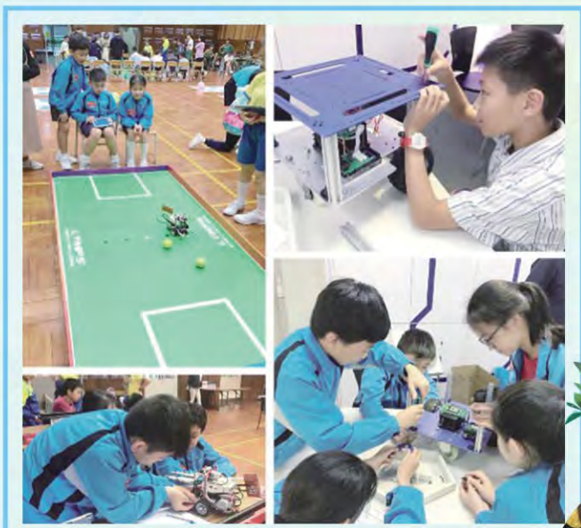
邏輯數學智能：透過解難思維等活動，讓學生多動腦筋。 Logical-Mathematical Intelligence: Engaging students in problem-solving and critical thinking activities to stimulate their minds.