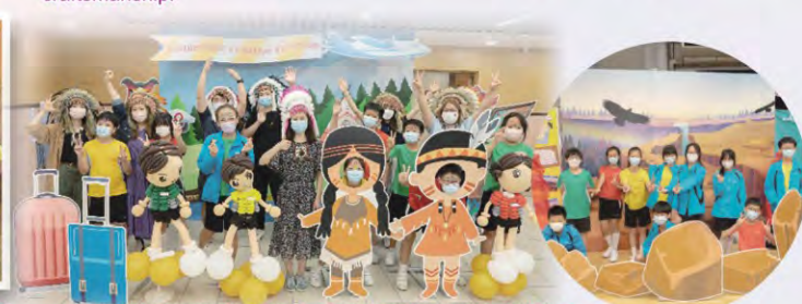
成長體驗營讓學生認識不同國家的文化，開拓國際視野。 The growth experiential camp enables students to learn about different cultures from various countries, broadening their international perspectives.