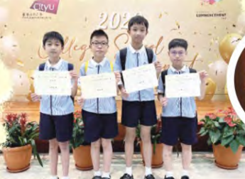
小學數學創意解難比賽 金獎 Gold Award in the Primary School Creative Problem-Solving Mathematics Competition.