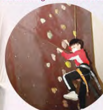
小六畢業營有不同的成長歷奇活動，提升學生的自我管理、與人相處和團隊合作的能力，為升中做好準備。 The graduation camp for Primary 6 student includes various growth-oriented activities aimed at enhancing students' self-management, interpersonal skills, and teamwork abilities, preparing them for their transition to secondary school.