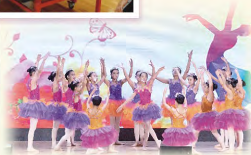
芭蕾舞隊 Ballet Team