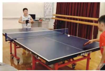
乒乓球隊 Table Tennis Team