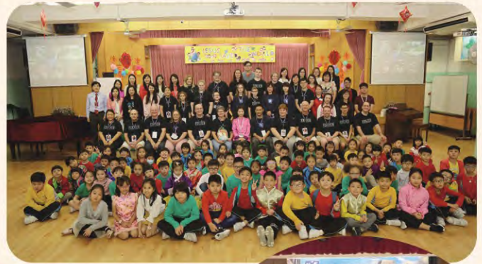
同學與外籍老師一起參與宗教活動，頌讚主恩。 Students and foreign teachers participate together in religious activities, offering praise for God's grace.

The Lutheran Church has a huge international education network. Foreign short-term missionary teams and international volunteers often visit the school to spread the Gospel. At the same time, it allows students to increase their chances of listening to authentic English and broaden their international horizons, so that the school can promote the characteristics of international cultural education.