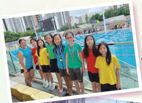
女子泳隊 Girl's Swimming Team