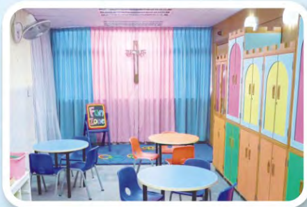
Toy Library 玩具圖書館