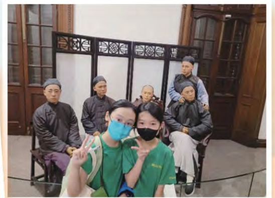
參觀孫中山紀念館，認識孫中山先生的生平及對中國所帶來的貢獻。 Visiting the Dr. Sun Yat Sen Memorial Hall provides an opportunity to learn about the life of Dr. Sun Yat Sen and his significant contributions to China.