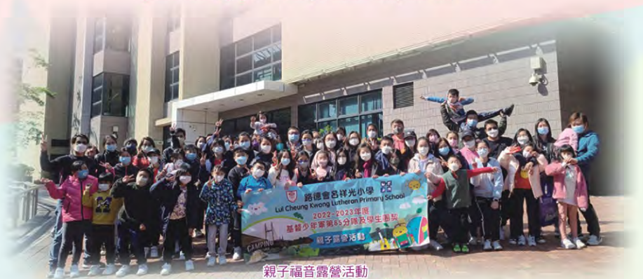
親子福音露營活動 Parent-Child Gospel Camping Activity