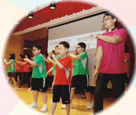
本會牧師帶領學生做讚美操，宣揚基督福音，培養個人靈命。 Lutheran church pastor leads students in praise exercises to proclaim the Gospel of Christ and cultivate personal spirituality.