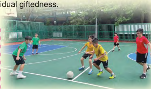
足球隊 Football Team

A variety of sports such as basketball, football, badminton, table tennis, track and field, fencing, taekwondo, ballet, Latin dance, K-POP dance, lion dance, rope skipping, swimming and other sports, are available for our students to strengthen their bodies and nurture their physical and mental well being.