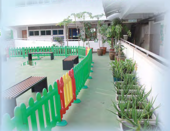
Terrace Garden 空中花園