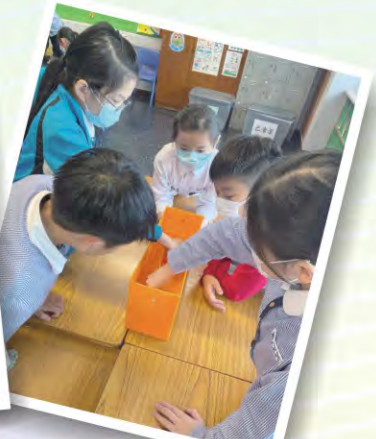
學生透過測試空氣現象和製作濾水器等等實驗，學會了空氣和水的特性。By conducting experiments that involve testing air phenomena and creating water filters, students learn about the properties of air and water. These hands-on activities enable them to gain a deeper understanding of these essential elements and their characteristics.