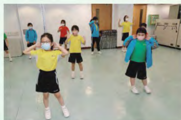
KPOP興趣班 KPOP Dance Enrichment Class