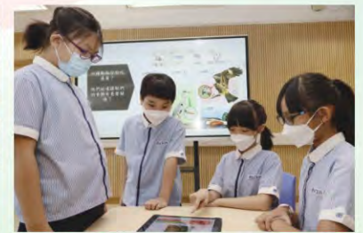
抽離小組匯聚能力較強的學生，於課堂以外時間提供進一步的高層次思維能力訓練。 We separate students with strong team-building skills and provide them with additional high-level thinking ability training outside of regular classroom hours.