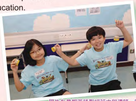
學生在暑期英語聖經班中與導師一同進行小組遊戲及製作手工。 During the Vacation Bible School, students participated in group games and engage in crafting activities alongside their tutors.