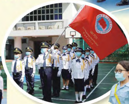
升旗隊 Flag Raising Team