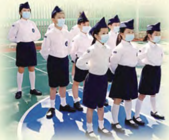
基督少年軍 The Boys' Brigade