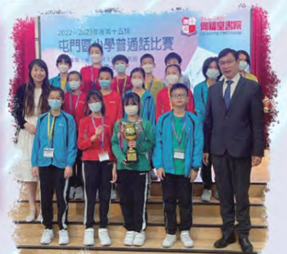
屯門區小學普通話比賽 - 積極參與獎、數字牌獎、普通話 遊蹤(視藝組)亞軍 Tuen Mun District Primary School Putonghua Competition The Active Participation Award, The Number Card Award, and the Second Place in the Mandarin Speech and Art Tour (Visual Arts Category).