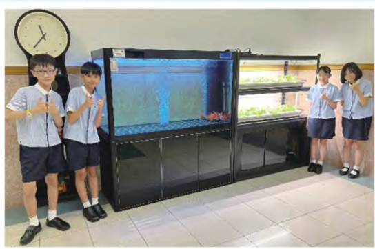
校內設有魚菜共生系統，讓學生透過觀察魚類及蔬菜的成長，了解生態循環系統。Our school has an aquaponics system where students can observe the growth of fish and vegetables, allowing them to understand the concept of an ecological cycle.