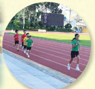
田徑隊 Track and Field Team