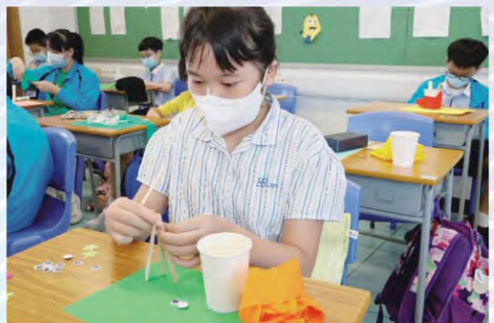
學生透應用閉合電路和感應器編程的知識，自行以環保物料製作智能電燈，讓學生能利用已有的知識與技能解決難題。Students apply their knowledge of closed circuits and sensor programming to independently create smart lights using eco-friendly materials. This allows students to utilize their existing knowledge and skills to solve challenging problems.