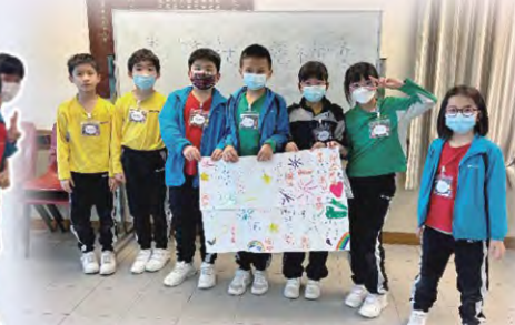
「成長的天空」計劃提升學生的抗逆力。 Understanding Adolescent Project aims to enhance students' resilience and ability to cope with adversity.