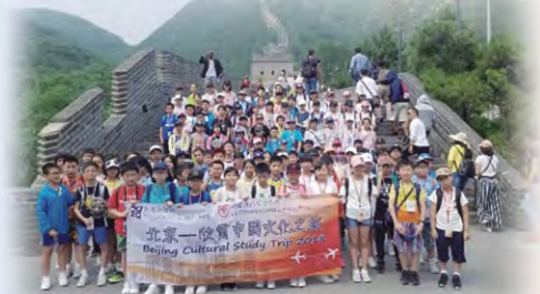
學生到北京交流，認識祖國悠久的歷史文化，以及了解國家近年的發展及。 Students participate in an exchange program to Beijing, where they have the opportunity to learn about the rich history and culture of our motherland. They also gain insights into the recent developments and achievements of our nation.

Our school designs school-based student growth experience courses based on the experiential learning cycle theory, uses life-like themes, allows students to reflect during the learning process, trains them to construct the meaning of learning from personal experience, and then applies the knowledge they have learned, the skills they have mastered and the positive values and attitudes cultivated are practiced in daily life to help them face the challenges of growth and achieve a better future.