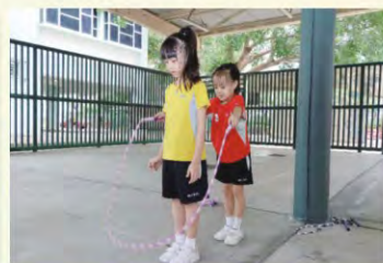
花式跳繩興趣班 Rope Skipping Class