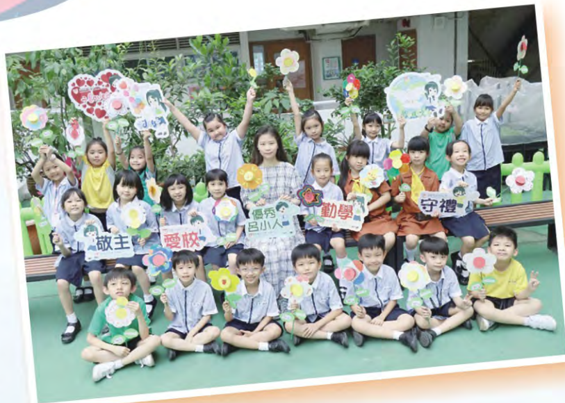
推行孝心頌親恩活動，傳揚中華傳統孝道。 Promote the "Filial Piety and Gratitude to Parents" campaign, spreading the traditional Chinese virtue of filial piety.

The school provides high-quality courses and a beautiful campus environment, allowing students to enlighten wisdom, build character, develop potential, broaden international horizons and nurture spiritual life, so that students can achieve a comprehensive and balanced development of body, mind and soul.