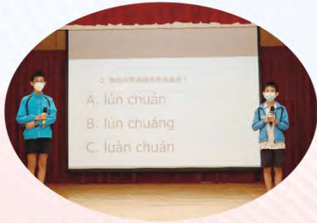
學生主持普通話週會，教導學生朗讀字詞和拼音，愉快地學習。 Students take on the role of hosting Mandarin Chinese weekly meetings, teaching their peers how to read words and pinyin, creating a joyful learning experience.