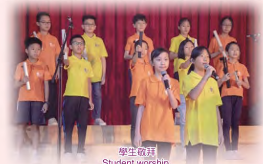
學生敬拜 Student worship