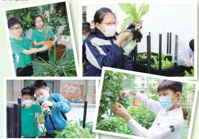
自然觀察智能：學生透過觀察自然界中的各種事物，對自然界產生好奇心和求知欲，以培育敏銳的觀察能力。 Naturalistic Intelligence: Students develop a sense of curiosity and a thirst for knowledge about the natural world through observing various elements in nature. This cultivates their keen observational skills.