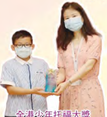
全港少年托福大獎 Hong Kong Junior TOEFL Award

After receiving careful nurturing at our school, students have achieved remarkable accomplishments in academics, sports, and the arts.