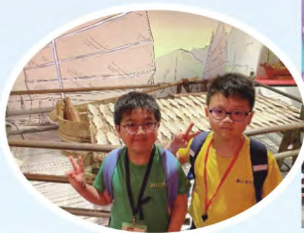
參觀香港歷史博物館，增加對香港歷史及文物的興趣，建立鄉土感情和民族認同感。 Visiting the Hong Kong History Museum helps to cultivate an interest in Hong Kong's history and artifacts, fostering a sense of local identity and national pride.