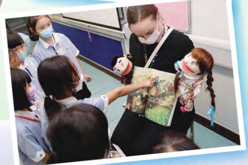
本校推行「木偶說故事」英文創意課程，深受學生歡迎。 Our school has implemented the "Puppet Storytelling" English creative curriculum, which has been highly popular among students.