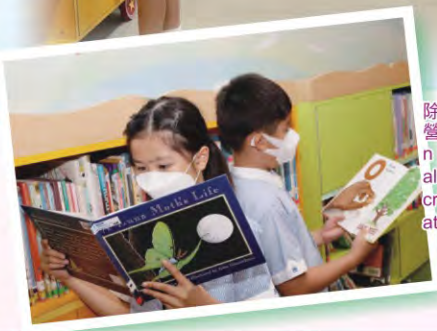
除了圖書館，本校亦設有閱讀長廊，營造濃厚的閱讀氛圍。 In addition to the library, our school also has a Solomon Storyland, creating a vibrant reading atmosphere.