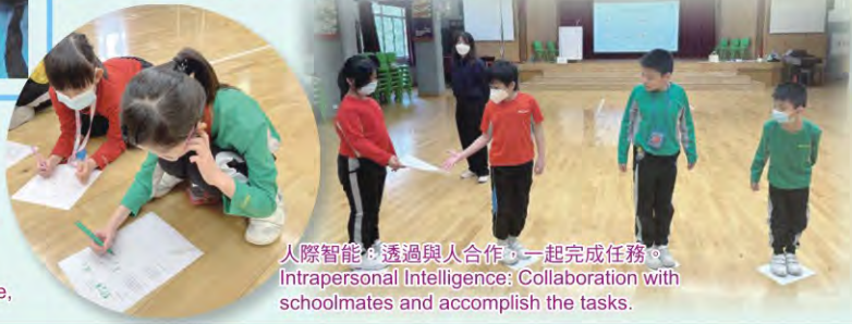
人際智能：透過與人合作，一起完成任務。 Interpersonal Intelligence: Collaboration with schoolmates and accomplish the tasks.