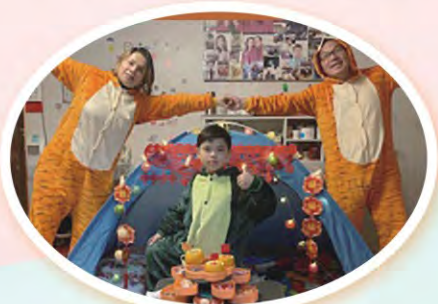
親子福音活動 Parent-Child Gospel Activity