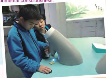
參觀香港科學館，透過親身嘗試和動手操作，探索科學的樂趣。 Visiting the Hong Kong Science Museum allows for hands-on exploration and firsthand experiences, enabling individuals to discover the joy of science.