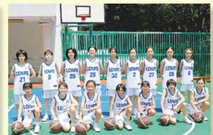
女子籃球隊 Girl's Basketball Team