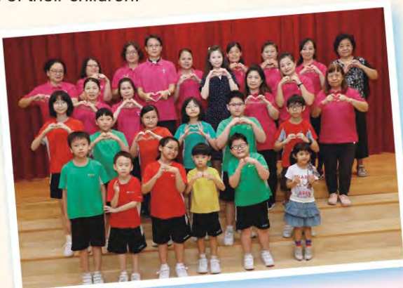
家長及學生一起讚美神。 Parents and students join together in praising God.

The pastor of the school regularly compiles evangelical publications to record the evangelical information on the campus, so that parents can understand the evangelical activities on campus and the spiritual growth of their children.