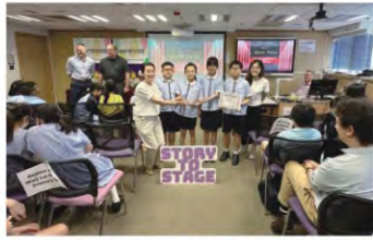
The Outstanding Presentation of the Theme of Positivity