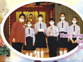
Kam Lung Storyboard Telling Competition 亞軍 Second Place in the Kam Lung Storyboard Telling Competition