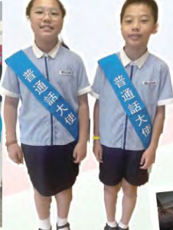
本校設有普通話大使，在小息時與各級學生進行普通話繞口令活動，使學生能練得一口流利的普通話。 Our school has Mandarin Ambassadors who engage in tongue twister activities with students of all levels during break time, enabling them to practice and become fluent in Mandarin.