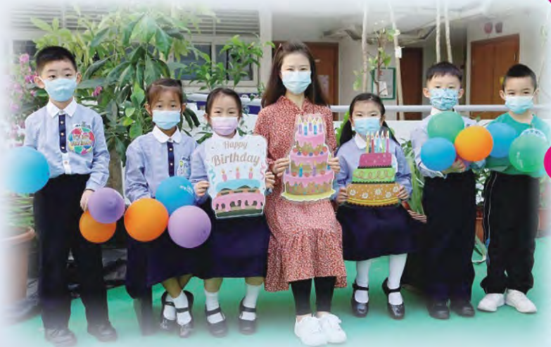
舉辦全校生日慶祝會，宣揚關愛精神。 Organize a school-wide birthday celebration event to promote a spirit of care and compassion.

The school was founded in 1982. There are Lutheran Lui Cheung Kwong Lutheran Kindergarten and Lutheran Lui Cheung Kwong Secondary School in the same district. In addition, Hong Kong Lutheran Social Service, Lutheran Family Counseling Center, and school-based educational psychology services also provide support services for students and parents of our school.