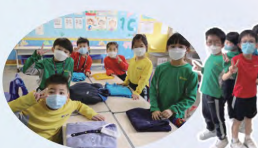
初小成長體驗讓學生學習獨立處事，提升自理能力。 The growth experiential camp allows students to learn how to handle tasks independently and enhance their self-care abilities.