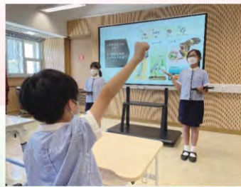
抽離式資優課程 Disengaged Learning Activities

The three gifted education elements of high-level thinking skills, creativity, personal and social skills are added to the regular courses, and learning diversity is taken care of by asking questions at different levels, group learning, and layered exercises in the regular classroom. In addition, pull-out plans, talent pools, leadership training, etc. are set up to promote the popularization of gifted education.