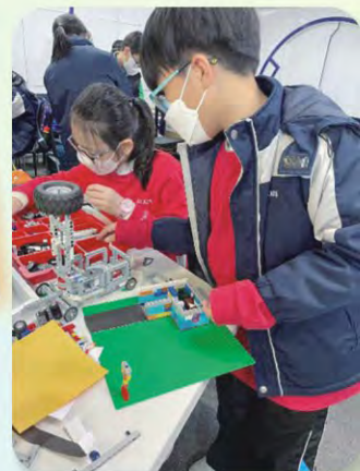
學生為比賽作準備，自行組裝不同的零件，製作機械人賽車。 Students prepared for the competition by independently assembling various components to create robotic race cars.