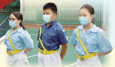
交通安全隊 Traffic Safety Team