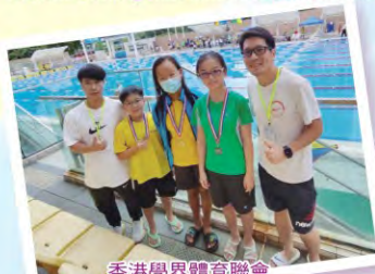
香港學界體育聯會 22-23年度屯門區小學校際游泳比賽 亞軍、季軍 Hong Kong Schools Sports Federation 22-23 Tuen Mun District Primary Schools Inter-School Swimming Competition 1st Runner-up and 2nd Runner-up