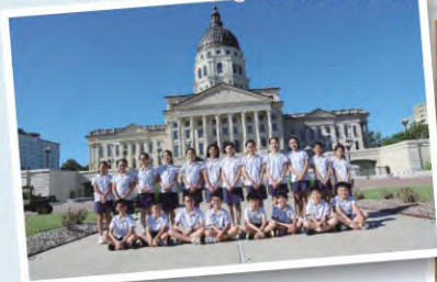
學生遠赴美國堪薩斯州交流，參觀市政府大樓，認識堪薩斯州歷史及市政府行政工作。 The students traveled to Kansas, USA for an exchange program, where they visited the City Hall to learn about the history of Kansas and the administrative work of the local government.