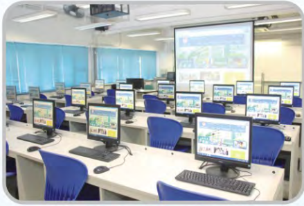
Computer Room 電腦室