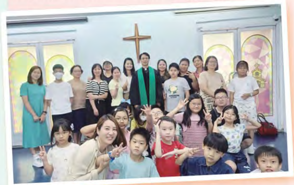
家長帶同子女參加團契聚會。 Parents bring their children to fellowship gatherings.

Our school has Bible classes every week, but there is no assessment for Bible classes in our school. The Bible classes allow students to understand the Bible and know Christ from an early age, and nurture students to follow the teachings of the Bible in their lives, build a good character and an upright life.