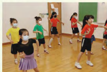
拉丁舞興趣班 Latin Dance Enrichment Class