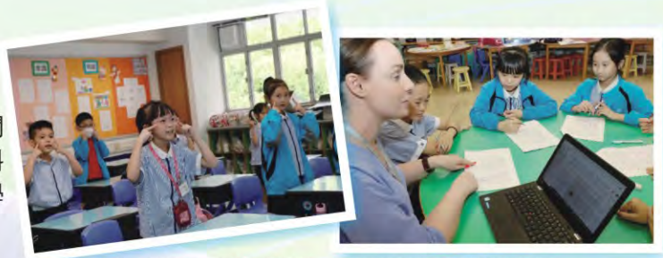
課堂上透過多元化的學習活動，幫助學生建構不同學科的知識。 In the classroom, diverse learning activities are employed to help students construct knowledge in various subjects.

課程著重教授學生學習策略，如中英文科的識字、閱讀、寫作、聆聽、說話策略，英普的拼音學習，數學科的解難策略，課堂上並提供應用與實踐的機會，培養學生獨立學習能力。