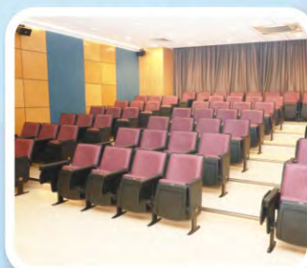
Cinema And Conference Center 電影院暨會議中心