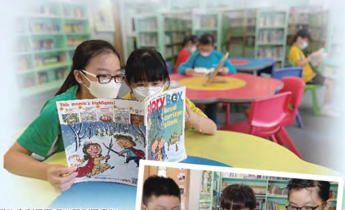
學生會利用閒暇時間到圖書館借閱讀書，增進課外知識。 Students make use of their free time to visit the library and borrow books, enhancing their knowledge beyond the classroom.