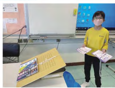
學生在課堂上進行模擬實驗，透過不同的實驗，了解斜面和滾子的科學原理。In the classroom, students engage in simulated experiments to understand the scientific principles of inclines and rolling objects through various hands-on experiments.