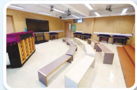
Music Room 音樂室