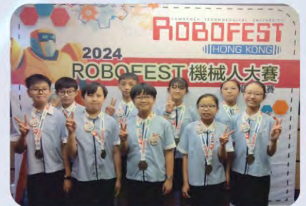
Robofest BottleSumo 機械人相撲大賽 金獎及銀獎 Winning the Gold and Silver Awards in the Robofest BottleSumo Robot Sumo Competition