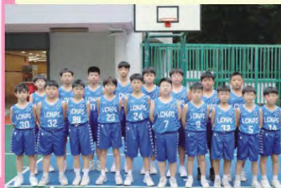
男子籃球隊 Boy's Basketball Team