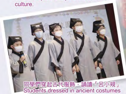
同學們穿起古代服飾，誦讀「呂小規」 Students, dressed in ancient costumes and recited passages from the LCKPS Good Student Policy.

The student ambassadors in our school exemplify Chinese etiquette and serve as role models for their peers, setting a positive example for others to follow.