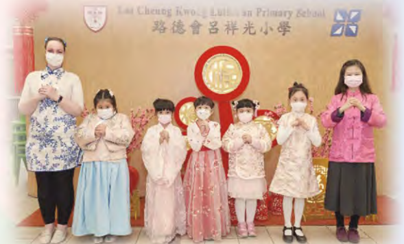
全校師生穿著華服參與中華文化薈萃日，並以中國傳統的拱手禮打招呼。The entire school, including teachers and students, dresses in traditional Chinese attire to participate in the Chinese Cultural Day. They greet each other using the traditional Chinese gesture of cupping their hands together in a gesture of respect.

Our school is the pilot school of the "Chinese Etiquette Education Program" of the Education University of Hong Kong Center for Chinese Studies. It teaches students the core values related to traditional Chinese etiquette and Chinese culture from an early age, actively promotes moral education based on Chinese culture, promotes excellent traditional Chinese culture and virtues, and moulds students' excellent character and behavior.