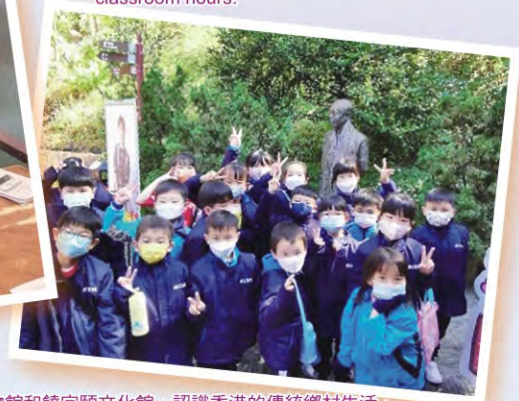
初小學生參觀香港文化博物館和饒宗頤文化館，認識香港的傳統鄉村生活、中國書法文化及了解香港的歷史。 Primary one and two students visit the Hong Kong Heritage Museum and the Jao Tsung-I Academy to learn about traditional rural life in Hong Kong, Chinese calligraphy culture, and gain insights into the history of Hong Kong.