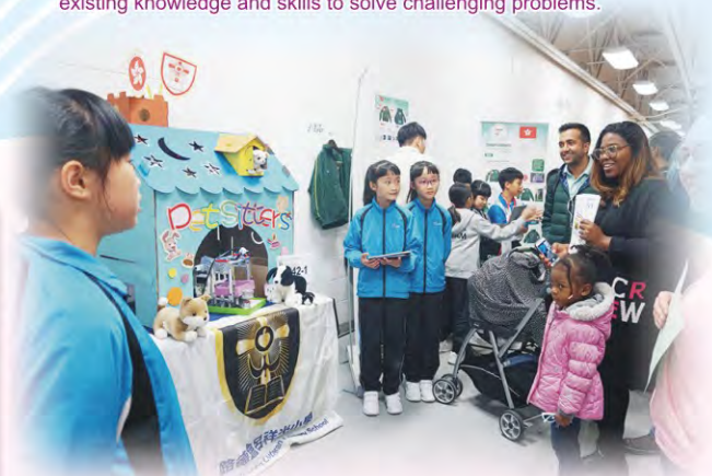
學生在Robofest機械人大賽Exhibition機械人創意賽(初級組)中取得冠軍，代表香港遠赴美國出賽。Students achieved first place in the Mechanical Minds category at the ROBOFEST Robotics Competition Exhibition (Junior Division), earning the opportunity to represent Hong Kong and compete in the United States.