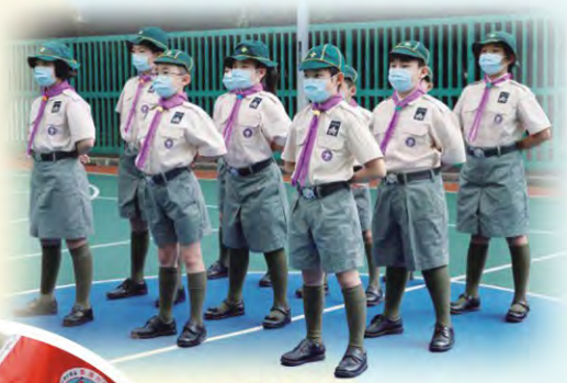
幼童軍 Cub Scouts