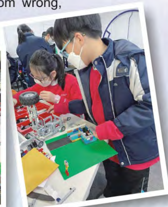
本校開設機械人拔尖課程，讓學生在科學、科技及數學範疇建立穩固的知識基礎，強化學生綜合和應用知識與技能的能力，培養學生二十一世紀所需要的創造力、協作和解決問題能力。Our school offers an advanced robotics program that allows students to build a strong foundation in science, technology, and mathematics. This program strengthens students' abilities to integrate and apply knowledge and skills, while fostering their creativity, collaboration, and problem-solving skills, all of which are essential in the 21st century.